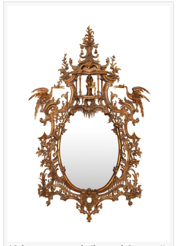
18th century oval giltwood George II or George III Chinese Chippendale mirror after a design by Thomas Chippendale (English, 1718-1779), 86 inches tall by 50 inches wide (est. $10,000-$15,000).