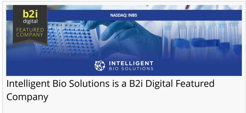
Intelligent Bio Solutions is a B2i Digital Featured Company