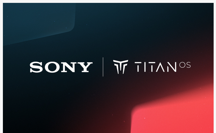
Sony x Titan

This launch will significantly expand Titan OS' reach, bringing its FAST content offering to new