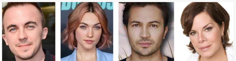
AI thriller Renner cast