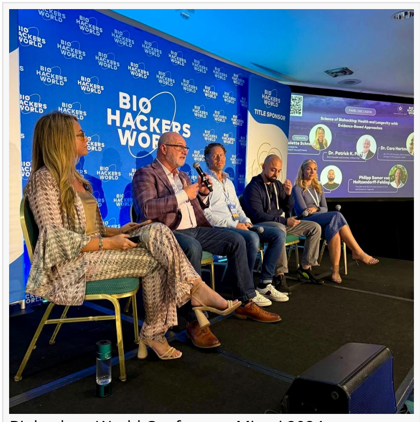
Biohackers World Conference Miami 2024

MIAMI, FL, UNITED STATES, October 31, 2024 /EINPresswire.com/ -- The Biohackers World Conference & Expo made waves in Miami this past weekend, drawing over 700 biohacking enthusiasts, wellness experts, and technology pioneers to the Miami Convention Center. The two-day event featured over 30 esteemed speakers, high-impact keynotes, and an impressive expo floor with over 40 exhibitors, marking the Miami debut as a landmark event for those passionate about human optimization and wellness innovation.