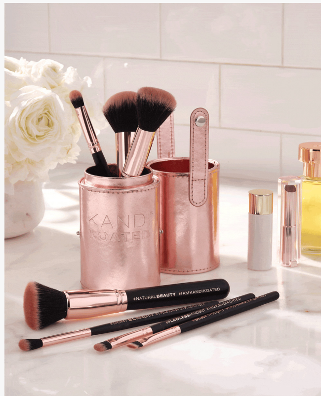
This 7-brush pro-quality set comes with a rose gold travel case that converts to a brush holder.