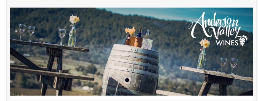
Wine tasting overlooking vineyard in Anderson Valley

Known for cool-climate wines and a strong commitment to regenerative farming, Anderson Valley stands out within Mendocino County for pioneering sustainable practices that safeguard