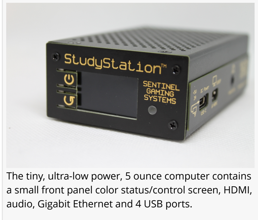
The tiny, ultra-low power, 5 ounce computer contains a small front panel color status/control screen, HDMI, audio, Gigabit Ethernet and 4 USB ports.