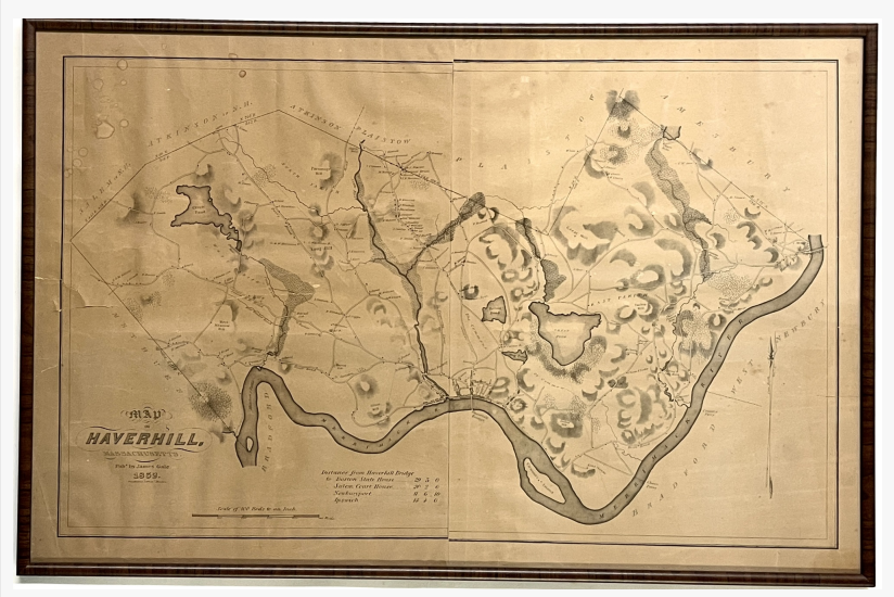
The postcards and other memorabilia from local towns in Massachusetts includes this rare 1832 map of Haverhill. Minimum bid: $1.

The collection of vintage and antique padlocks includes this lot of four smokehouse padlocks by Sargent Co. Minimum bid: $1.