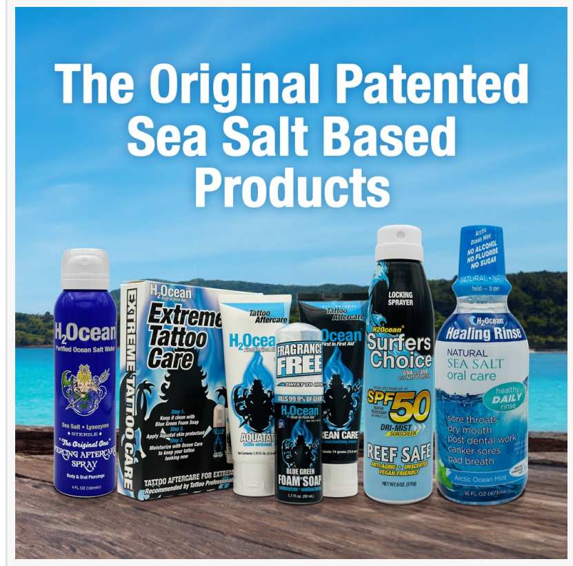
H2Ocean Original Sea Salt Based All Natural Products

All of H2Ocean's products are backed by patented science and rigorous testing. They are carefully formulated