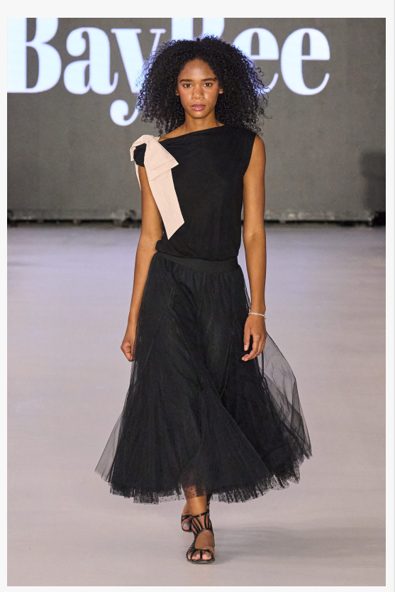
Look 06 from the BayBee Spring 2025 Runway Show