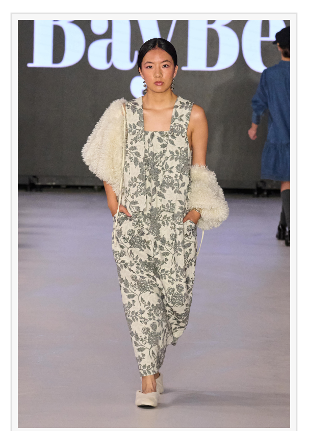
Look 02 from the BayBee Spring 2025 Runway Show