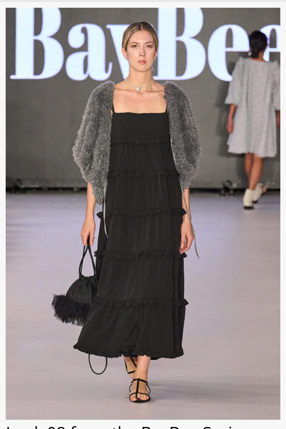
Look 08 from the BayBee Spring 2025 Runway Show

This press release can be viewed online at: https://www.einpresswire.com/article/757073380