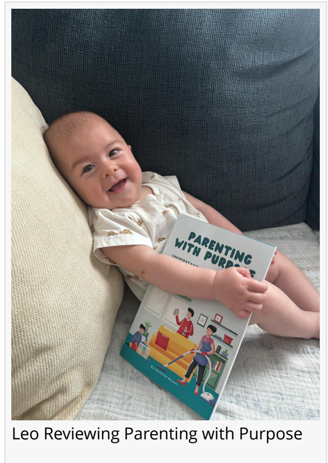
Leo Reviewing Parenting with Purpose