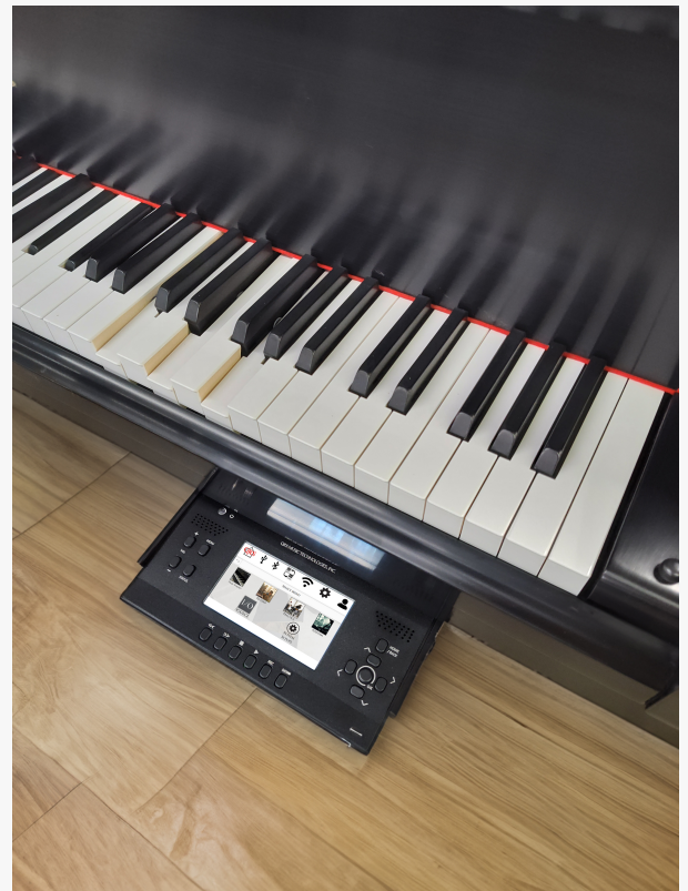
PNOmation 4's User Interface on slide out bracket