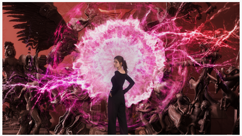
The 'Legend Moments' photo zone celebrating the 2024 League of Legends World Championship victory

CUZ is a creative media art collective that unites artists and developers to create transformative digital experiences. The company specializes in immersive media content, CG/VFX animation, and media art exhibitions, delivering unique stories and experiences. Through its dedicated research and development lab, CUZ continuously explores and implements emerging technologies, including AR, VR, and computer vision. The company's mission is to make artistic experiences accessible to the public through innovative media art at the intersection of technology and creativity.