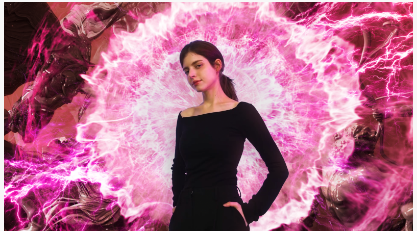
The 'Legend Moments' photo zone celebrating the 2024 League of Legends World Championship victory