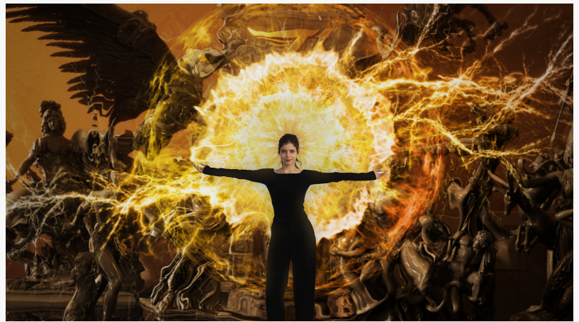
The 'Legend Moments' photo zone celebrating the 2024 League of Legends World Championship victory