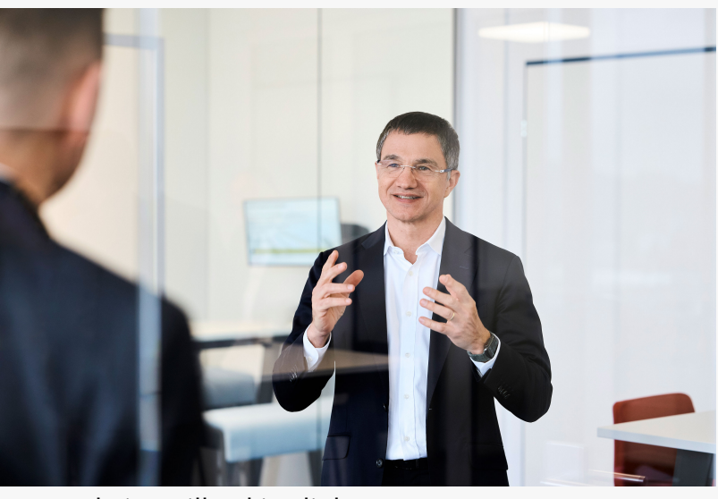
CEO Fabrice Billard in dialogue

higher financial expenses compared to the previous year period and a lower tax rate of 24.8% (previous year: 25.3%), the Group's net income increased to CHF 37.2 mn (+14.8% year-on-year). Additionally, the Group continues to effectively leverage its asset base to create value, as demonstrated by the high Return on Net Operating Assets (RONOA) of 28.6%, clearly above the mid-range guidance of >25%. On the financing side, the CHF 100 mn bond, which expired on September 30, 2024, was renewed and increased to CHF 150 mn.