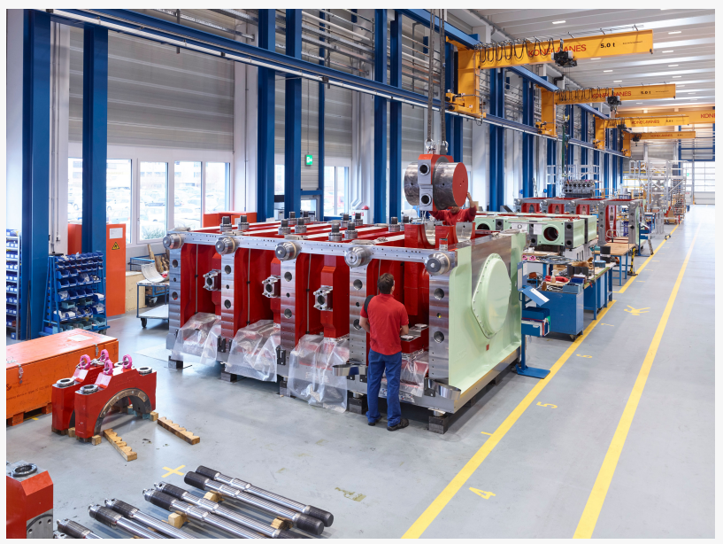
Hyper Compressor Assembly at Burckhardt Compression

Following a year of normalization, the overall market has trended positively in the first half of the fiscal year 2024, driven by the global need for more energy related to GDP growth and the ongoing transition towards new energies. Against this backdrop, the Systems Division achieved a strong order intake of CHF 452.8 mn, representing a growth of 10.6% (11.2% net of currency translation effects). In particular, the demand for Hyper Compressors continued at a high level, driven by expectations for strong solar panel demand growth and the increase of living standards in Asia. The markets for LPG ships remained very high, buoyed by the rising global energy demand, while the expected substantial rise of green ammonia transport by ship has provided additional impulses, as evidenced by orders secured by the company for compressors for very large Ammonia Carriers. Conversely, the Hydrogen Mobility and Energy market has been temporarily softening due to uncertainty created by elections in Europe and the USA and the delay in releasing final regulations and subsidies. Given hydrogen's