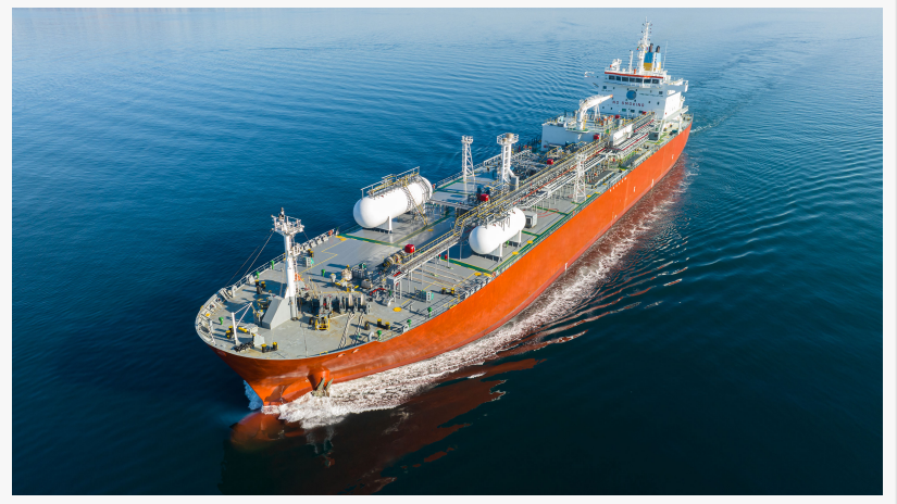
Very Large Ammonia Carrier

WINTERTHUR, ZURICH, SWITZERLAND, November 5, 2024 /EINPresswire.com/ --• Burckhardt Compression delivered strong results in the first half of fiscal year 2024: