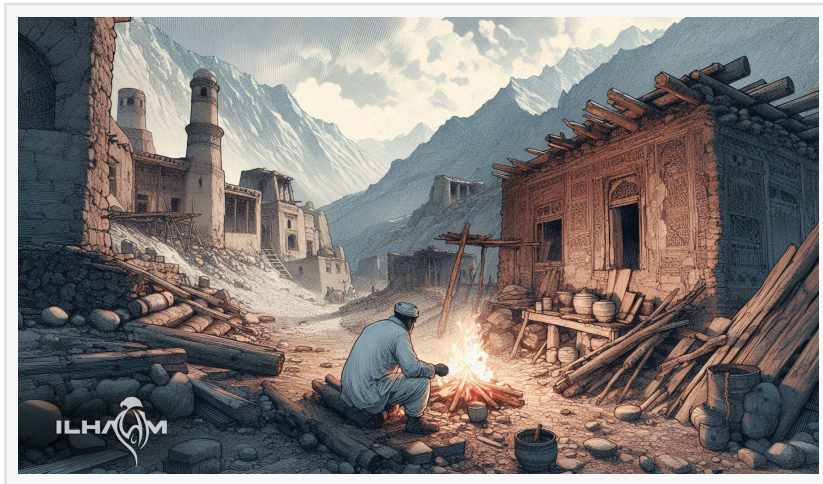
This image represents the feeling we're going with by the beginning of the game.

In addition to its creative vision, ILHAM is committed to fostering both professional and personal growth. The studio is assembling a diverse team that blends seasoned industry veterans with up-and-coming talent. Establishing its HQ in Richmond is part of ILHAM's broader goal to contribute to the local game development scene.