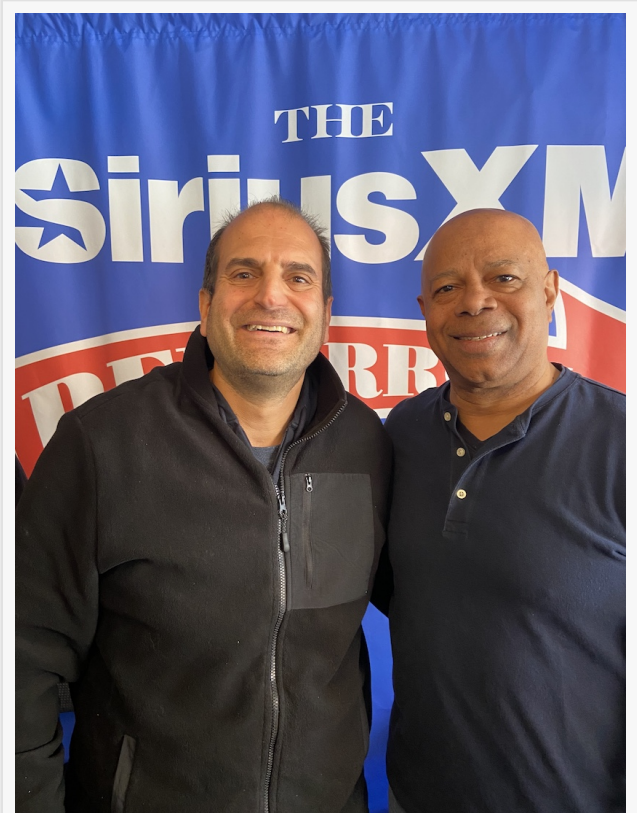
TravelingWiki Engaging with Sirius XM Channel 125 Surrounding Our Worldwide Live Appearance