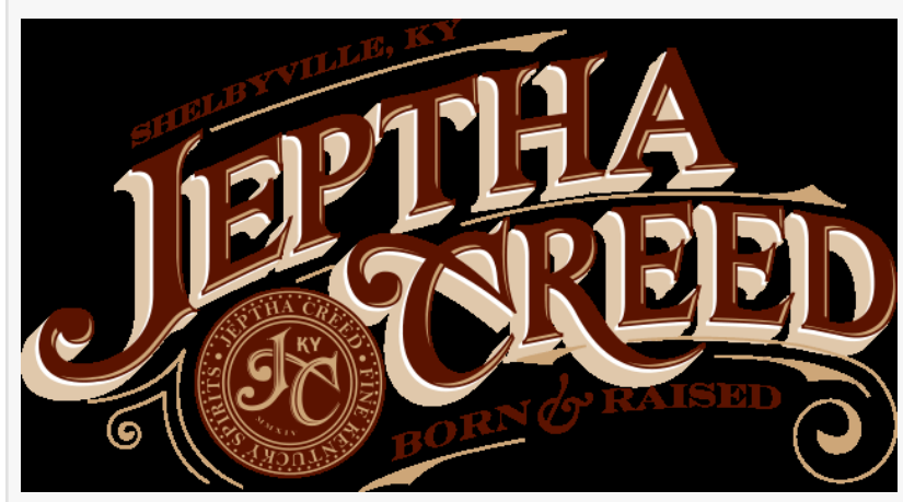
Jeptha Creed Distillery | JepthaCreed.com

#Subt30 presents The Tastemakers Series at Subterranean - November 13, 2024 | subt.net/30