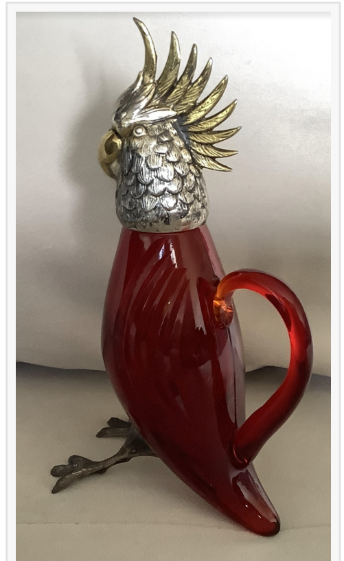
Cartier sterling silver and ruby glass cruet decanter made in Spain, a cockatiel sculpture in which the body is made of ruby red glass, the head and feet are made of sterling silver (est. $750-$900).