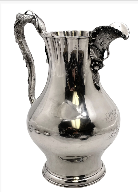
Eoeff & Shepard for Ball, Black & Co. coin silver pitcher, circa 1852-1861, beautifully adorned with raised natural motifs, bearing hallmarks and a monogram, 31.3 oz. (est. $1,800-$2,500).