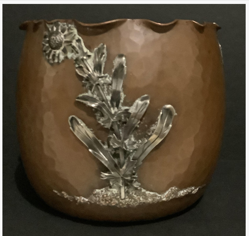
Circa 1850-1890 Gorham sterling silver and copper Japanese mixed metals Y50 jardiniere vase with applied 3-D floral design, with the original patina, marked on the bottom (est. $750-$950).