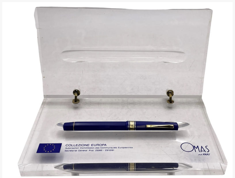
Omas fountain pen: Omas Limited Edition Europa fountain pen in the original display box. The pen, number 3133 out of a limited edition of 3500 produced, has a two-tone 18K gold nib (est. $675-$800).