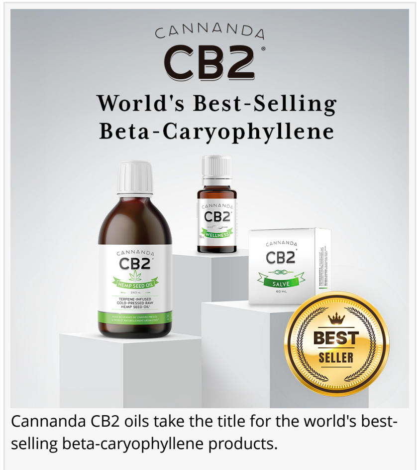
Cannanda CB2 oils take the title for the world's best-selling beta-caryophyllene products.