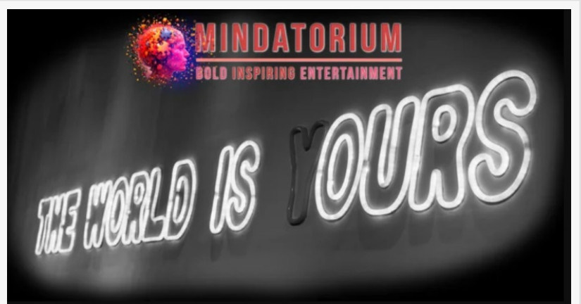
Mindatorium Global Share The Wealth Affiliate Program

Becoming a Mindatorium Share the Wealth Affiliate is a simple 3-step process. The company provides all the tools, guidance, mentorship, training and coaching necessary; the only thing required from an affiliate is their active participation.