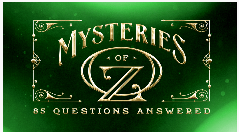
Mysteries of Oz Logo

Join us on this enchanting journey that promises to be both entertaining and enlightening. Don't miss your chance to unravel the mysteries of Oz.