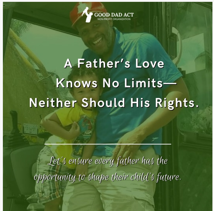
A fathers love knows no limits!