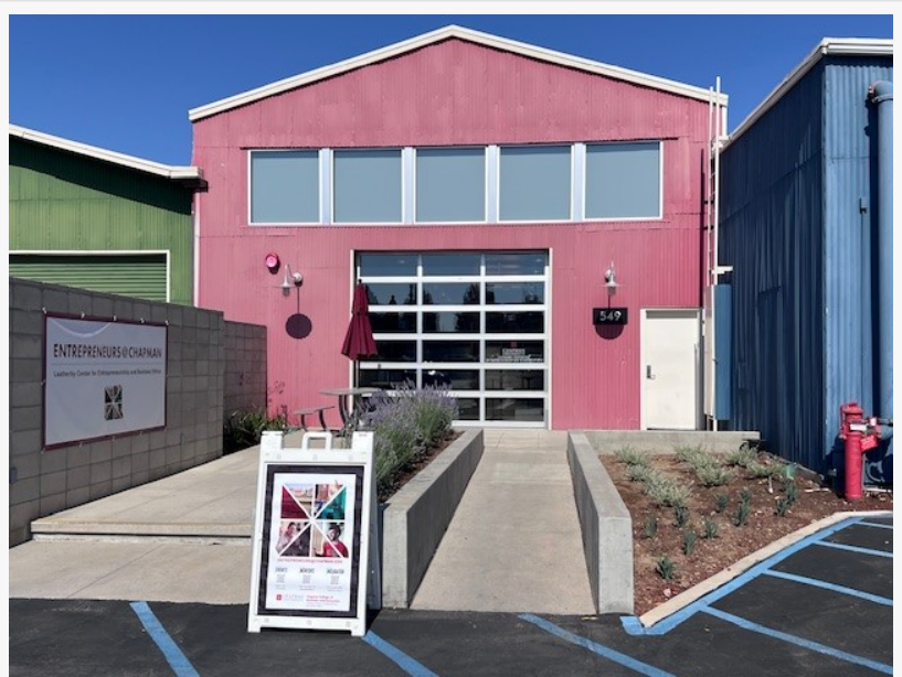
Leatherby Center for Entrepreneurship and Business Ethics Exterior