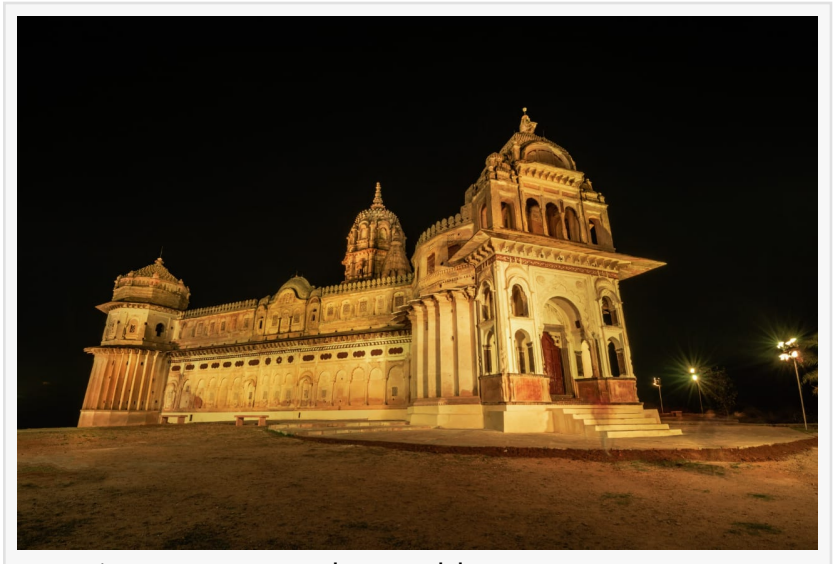
Laxmi Narayan Temple - Orchha