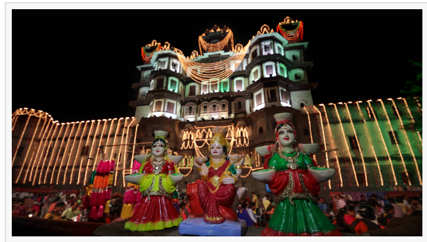
Rajwada Palace Indore

The biggest festival of India, Diwali is celebrated all over India with utmost fervor. In MP too the celebrations are worth witnessing. The whole state is decorated beautifully with dazzling lighting and earthen lamps. People perform puja in the evenings and celebrate this festival with fireworks and crackers. Families offer sweets and light diyas (oil lamps) to invite Ma Lakshmi's (The Hindu Goddess of wealth) blessings into their homes. The houses are cleaned and decorated with rangoli designs of various colors before Dhanteras. Diyas are lit to ward off evil