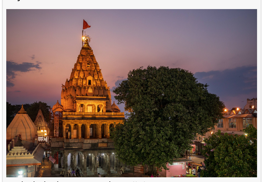
Mahakaleshwar Temple - Ujjain

spirits, and rice flour is used to make small footprints that signify the arrival of Lakshmi. In Madhya Pradesh, the harvest festival coincides with the festive season. The people of Madhya Pradesh celebrate this festival of lights with a difference by worshipping their cattle and other livestock as a mark of gratitude.