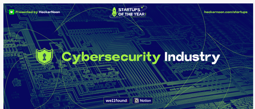
Featured Image for HackerNoon's Startups of the Year 2024 for the Cybersecurity category

This year, HackerNoon is going a step further by not only highlighting startups by cities, but also by industries, including Cybersecurity, to shed light on startups that are changing technology and the world for the better.