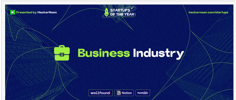
Featured Image for HackerNoon's Startups of the Year 2024 for the Business category

This year, HackerNoon is going a step further by not only highlighting startups by cities, but also by industries, including Business, to shed light on startups that are changing technology and the world for the better.