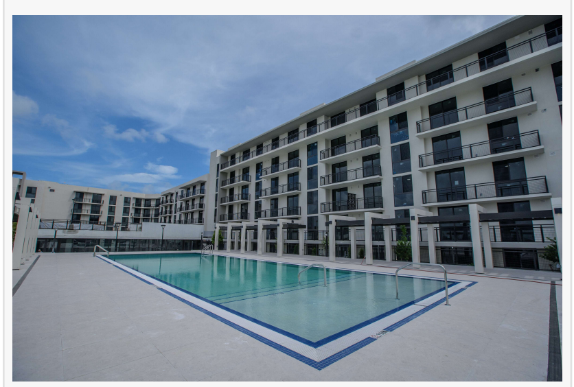
The pristine outdoor pool area surrounded by the building's contemporary architecture under a clear sky.

This press release can be viewed online at: https://www.einpresswire.com/article/757894824