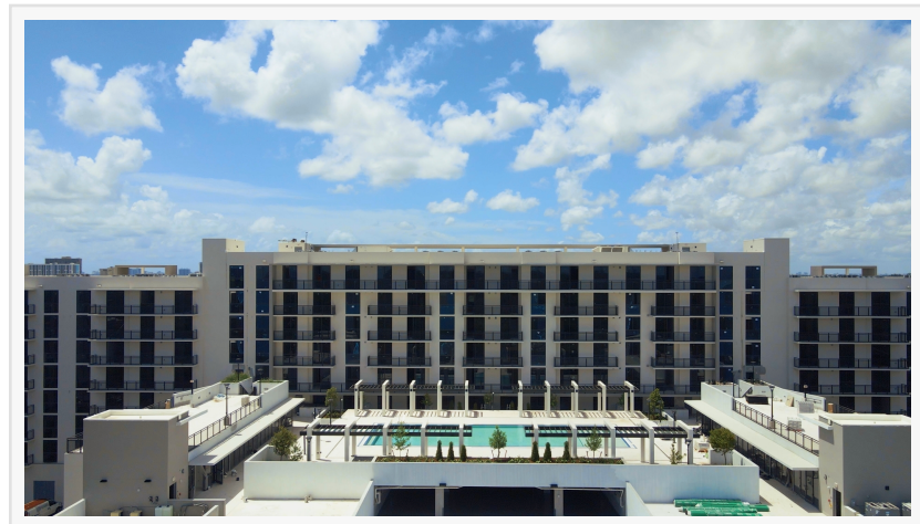
An inviting pool deck with sun-shaded areas, set against the backdrop of the Gardens Residences building.