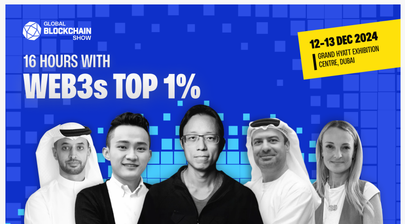
Global Blockchain Show - Grand Hyatt Exhibition Centre, Dubai