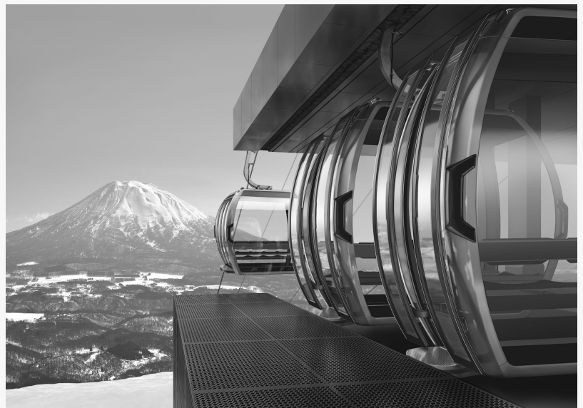
Niseko Hirafu New Gondola Lift Cabins