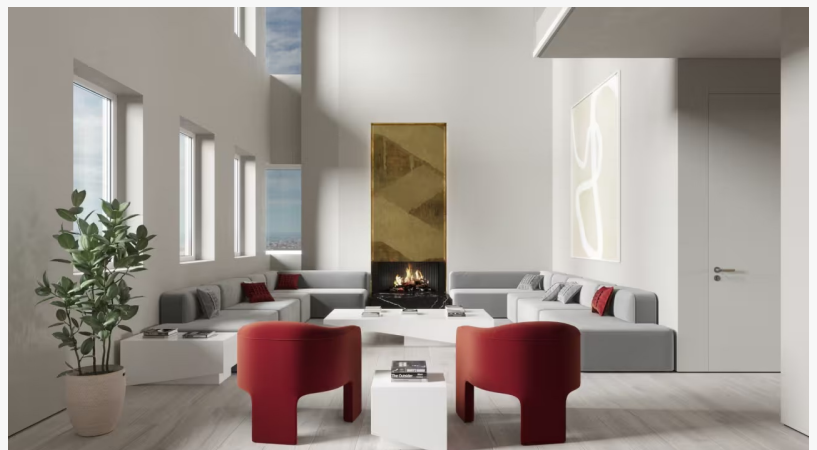
Sky Manor, Living Area