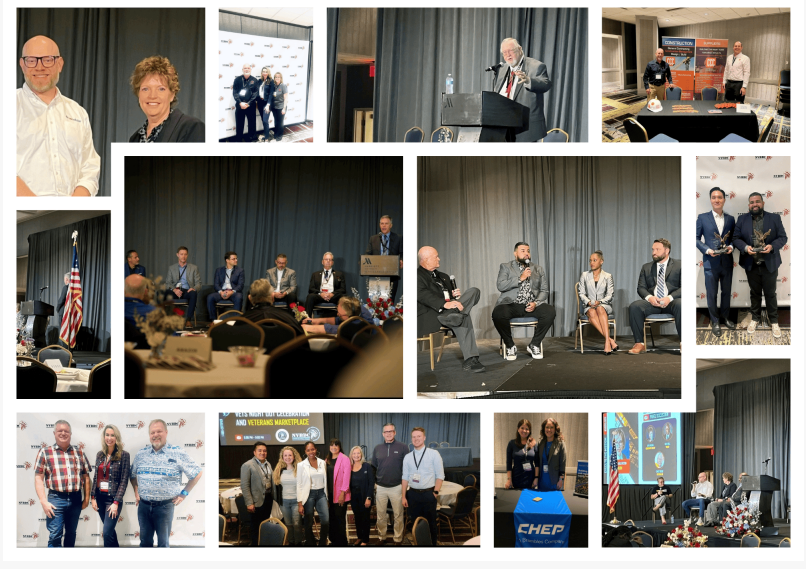
Check out NVBDC's social media to see more great photos!

These special awards are given at the discretion of NVBDC's President and CEO, acknowledging individuals and corporations whose exceptional contributions exceed expectations.