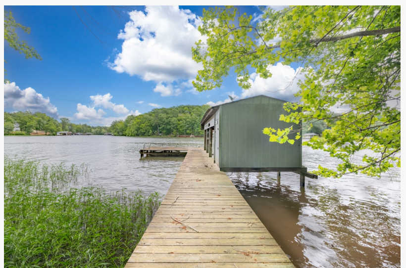
2181 Siouan Road, Ebony, VA 23845 (Brunswick County)

Property Addresses: 2181 Siouan Road, Ebony, VA 23845 (Brunswick County)