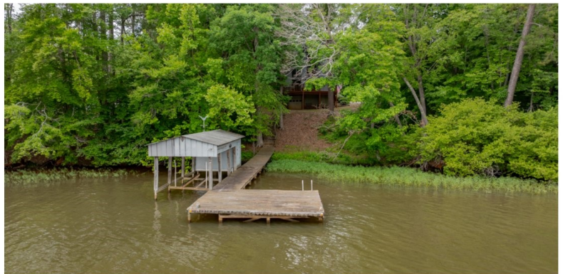
2181 Siouan Road, Ebony, VA 23845 (Brunswick County)