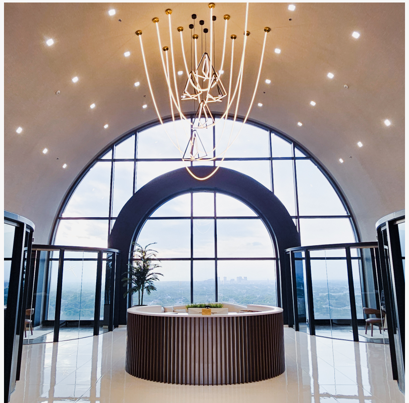
Lucid Private Offices NCX Reception

Situated on the 15th and 17th floors, Lucid Private Offices – NorthPark will redefine the coworking experience with unmatched amenities, breathtaking floor-to-ceiling views of downtown Dallas, and upscale design elements.