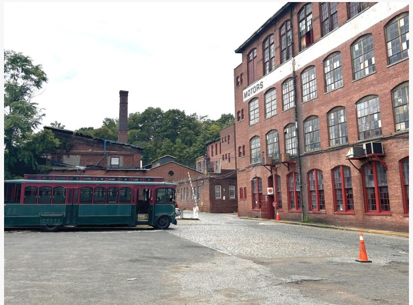
Art Factory Courtyard