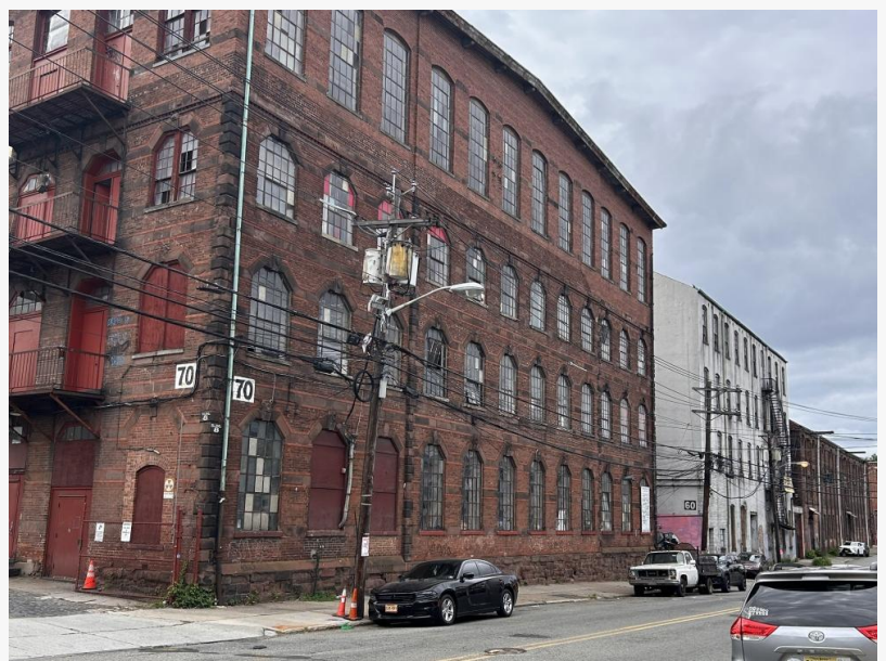
Great Falls Industrial Park