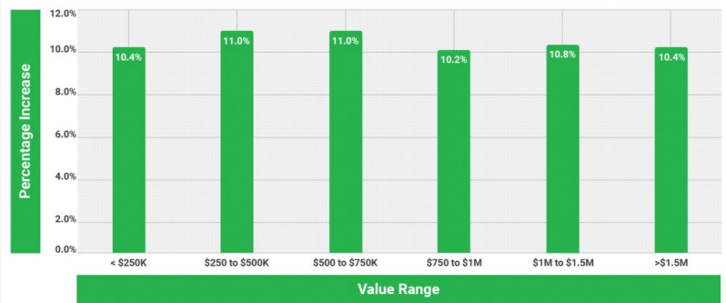
2024 Residential Increase by Value Range