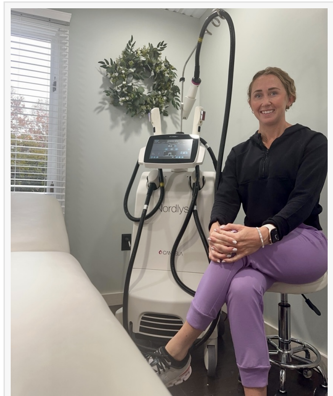
Root Fix Laser Hair and Skincare with the Nordlys Device

The Nordlys device allows us to broaden our capabilities in laser hair reduction and skin rejuvenation therapies, effectively treating a myriad of skin concerns including wrinkles, sun damage, scars, age spots, freckles, rosacea, and other skin imperfections. The award-winning Nordlys® system is known globally, has been used by celebrities, and was featured in multiple media outlets, including the Today Show on NBC.