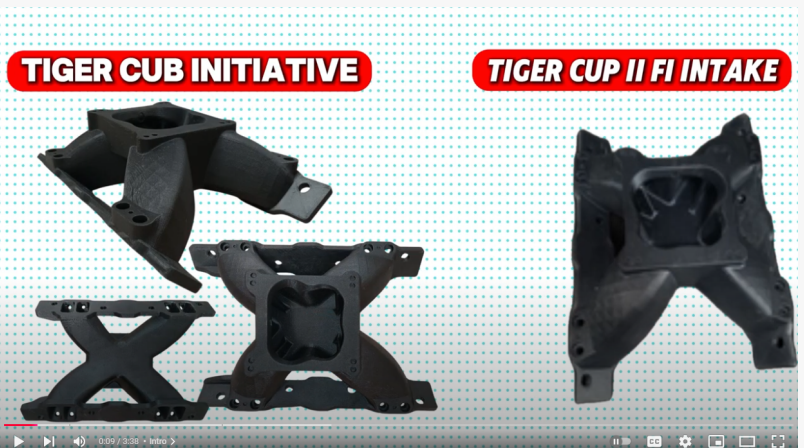
New Parts Unveiled