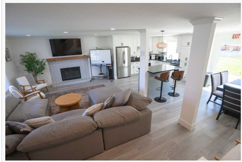
Drug rehab that feels like being at home in Lake Forest.

This tailored approach has made Harmony Junction one of the top choices for couples rehab in California, helping partners grow stronger while achieving sobriety.