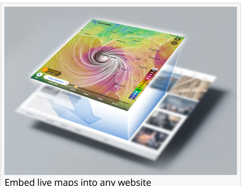
Embed live maps into any website

PRAGUE, CZECH REPUBLIC, November 6, 2024 /EINPresswire.com/ -- Ventusky has introduced a new feature that allows webmasters to embed interactive weather maps directly into their websites, bringing dynamic, realtime weather visualizations to any web platform. Responding to feedback from the Ventusky user community, this feature offers site owners a practical solution for displaying detailed weather information with the same functionality available on the main Ventusky site.