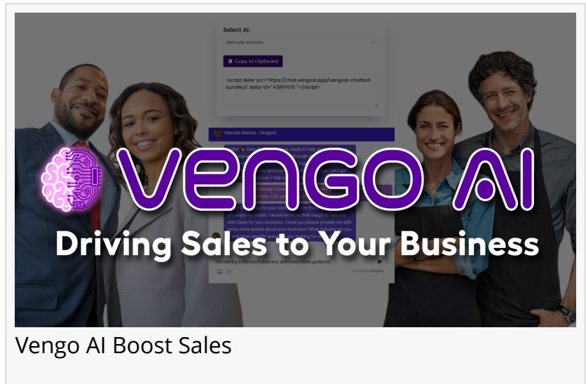
Vengo AI Boost Sales

EINPresswire.com/ -- Vengo AI , a next-generation B2B SaaS platform, today announces the launch of its revolutionary AI agent solution that enables small businesses to seamlessly integrate advanced, human-like AI identities into their websites. Backed by major players like Microsoft, NVIDIA, and OpenAI, Vengo AI breaks down the technical and financial barriers to AI adoption, allowing even non-technical users to deploy customized digital sales agents with ease.