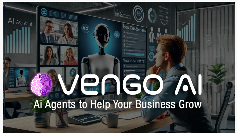
Vengo AI Business Owner