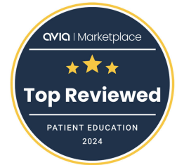
Top Reviewed badges awarded to Alelo