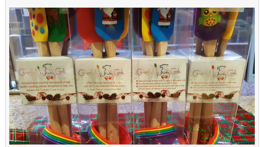
World's Best Holiday Spatula Sets