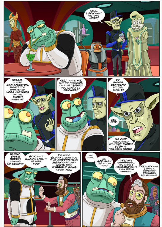
He Lost His Keys in Space Graphic Novel Page