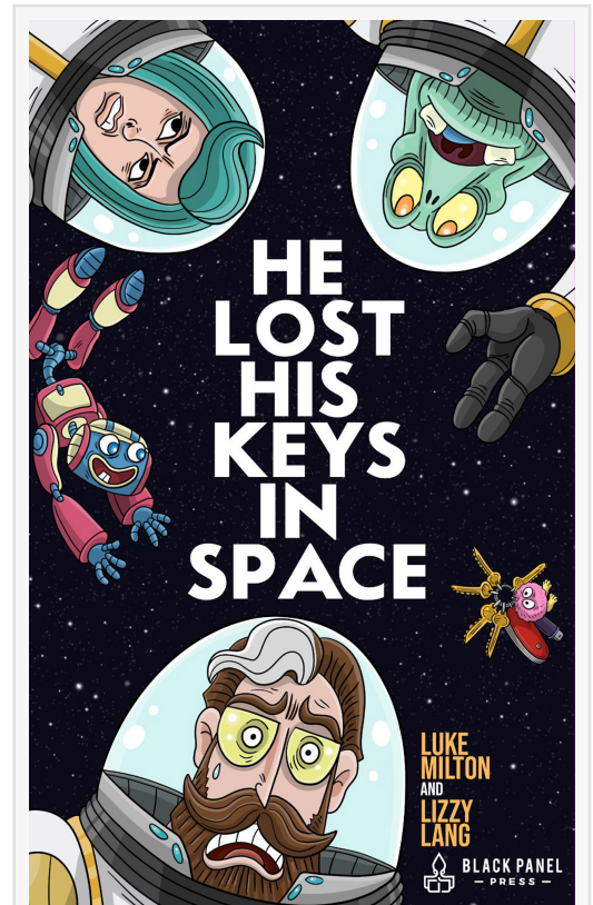
He Lost His Keys in Space Graphic Novel Cover

Based in Canada and distributed by Diamond Comic Distributors , Black Panel Press specializes in international graphic novels that challenge and expand the storytelling possibilities of the medium. With a commitment to publishing transformative narratives, Black Panel Press connects readers globally with powerful, thought-provoking works.