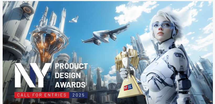
2025 NY Product Design Awards Calling for Entries