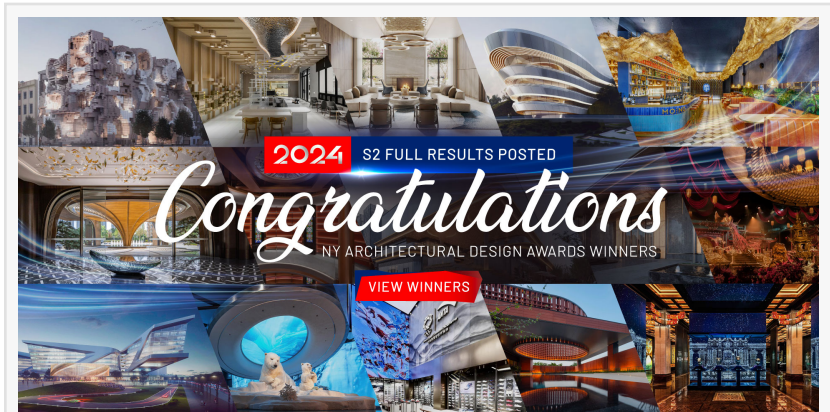
2024 NY Architectural Design Awards S2 Full Results Announced

A carefully selected panel of experts from various fields was tasked with evaluating the submissions in both categories. Comprising 38 jurors from 18 different countries, this