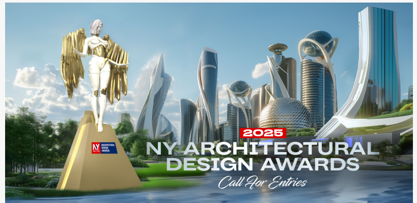
2025 NY Architectural Design Awards Calling for Entries