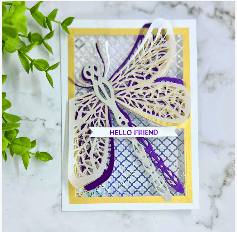
SILVER FOIL QUATREFOIL on ACETATE - 12x12 Sheet - DCWV