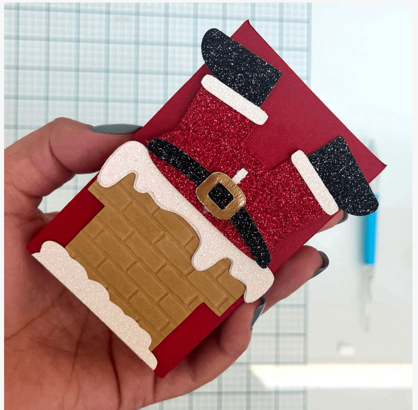
RUBY RED Glitter Luxe Cardstock - Encore Paper