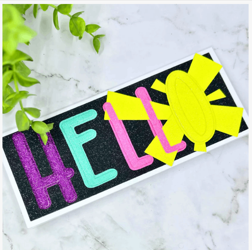
STARRY NIGHT Glitter Luxe Cardstock - Encore Paper

As demand for scrapbook supplies continues to grow, 12x12 Cardstock Shop has responded by continually broadening its selection. From vibrant scrapbook paper to textured sheets and specialty finishes, the shop offers diverse options for crafters seeking materials to enhance their projects. The introduction of unique colors, patterns, and finishes, such as glitter, metallic, and embossed cardstock, has made it easier for customers to craft personalized projects with professional quality. This expanded range has catered to a wider audience, from beginners to advanced crafters, ensuring that everyone can access the right materials for their creative vision.