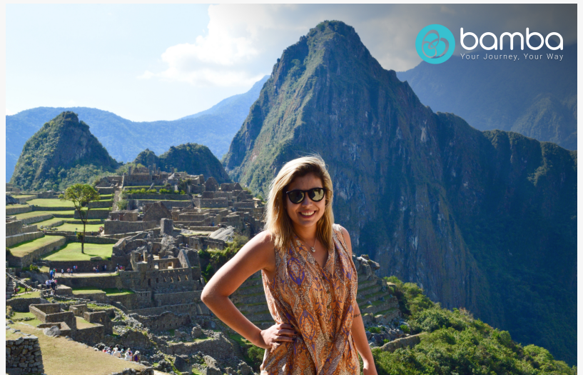
A happy tourist standing in front of Machu Picchu in Peru