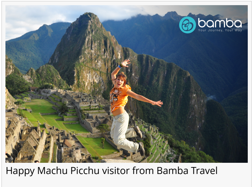
Happy Machu Picchu visitor from Bamba Travel

Embark on a self-driven adventure through the Yucatan Peninsula, starting and ending in Cancún. Discover the distinct allure of Valladolid, Mérida, Campeche, Bacalar, and Tulum.