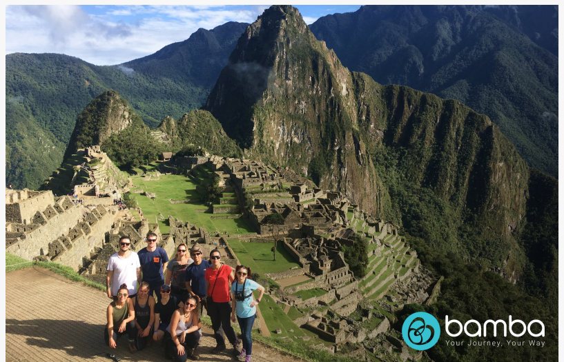
Group of friends visiting Machu Picchu via Bamba Travel