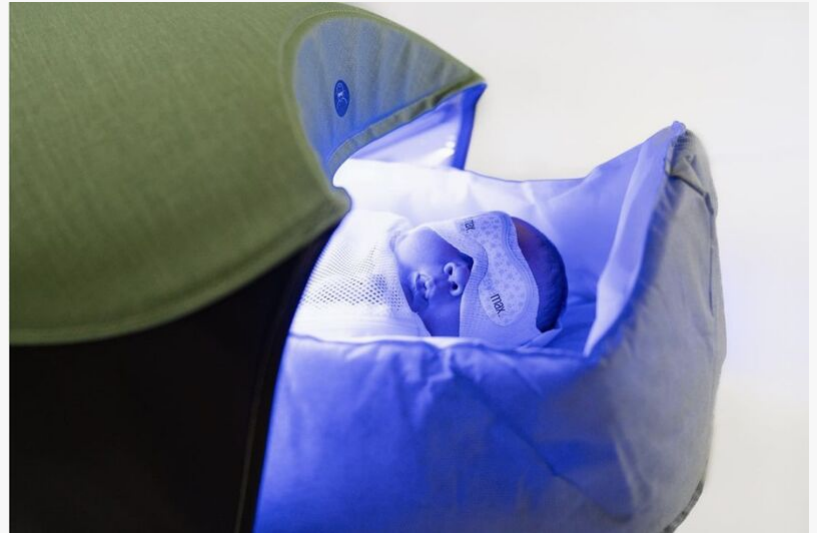
close up of infant treated with bili-hut