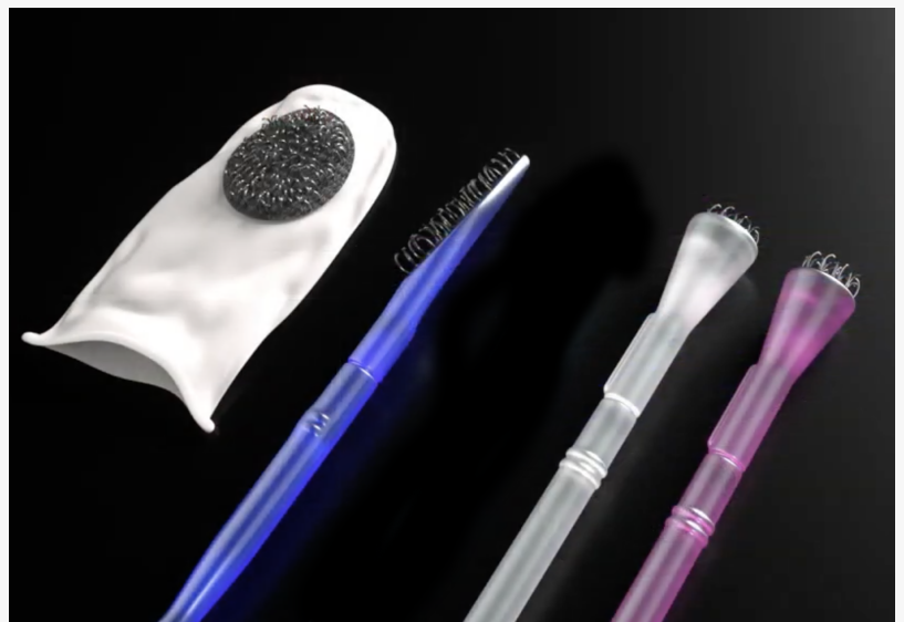
The Value of Hooked Brush-Curette Devices for Compassionate Tissue Removal for Chronic Wound Debridement and Biopsy