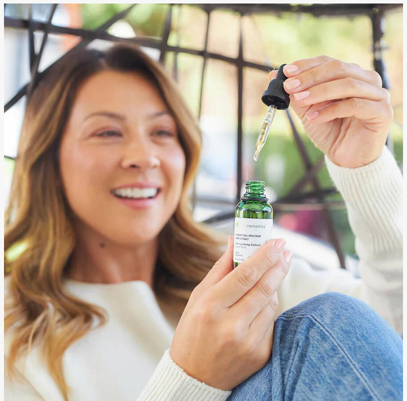
Clean Remedies offers a wide array of wellness solutions, including gummies, tinctures, and topicals.

The holiday savings continue with an extended Cyber Monday event. On December 2 and 3, 2024, Clean Remedies will offer 40% off sitewide on all purchases and 50% off sitewide for Subscribe & Save customers.